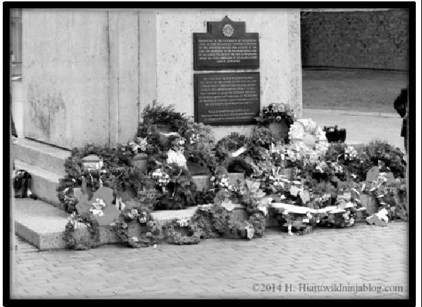
After the ceremony