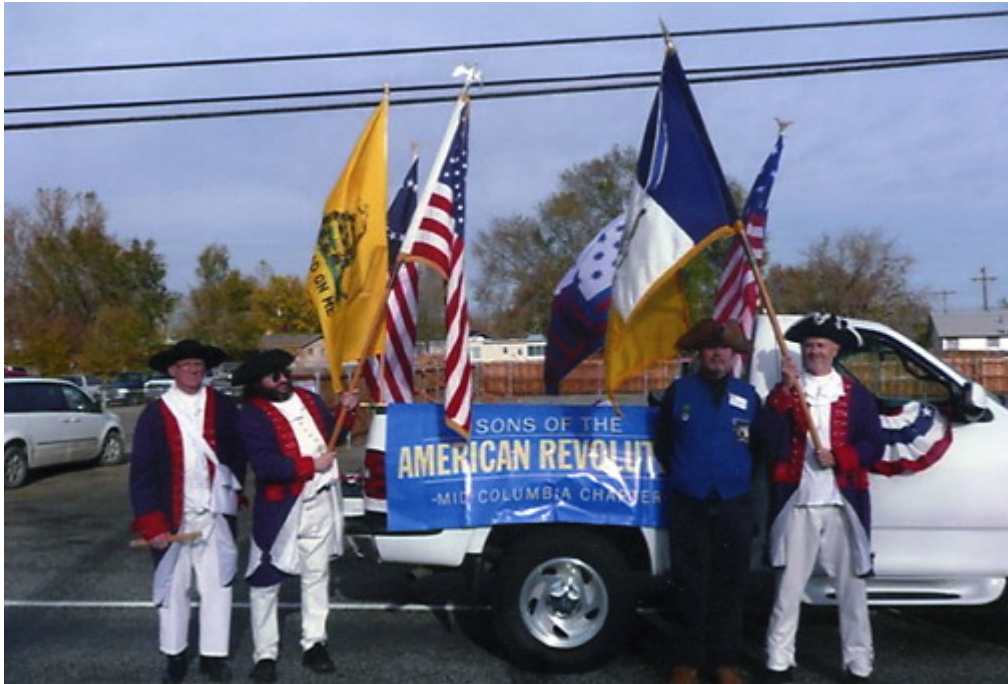
Members of the Mid-Columbia Chapter Color Guard at the Richland Veterans Day parade.