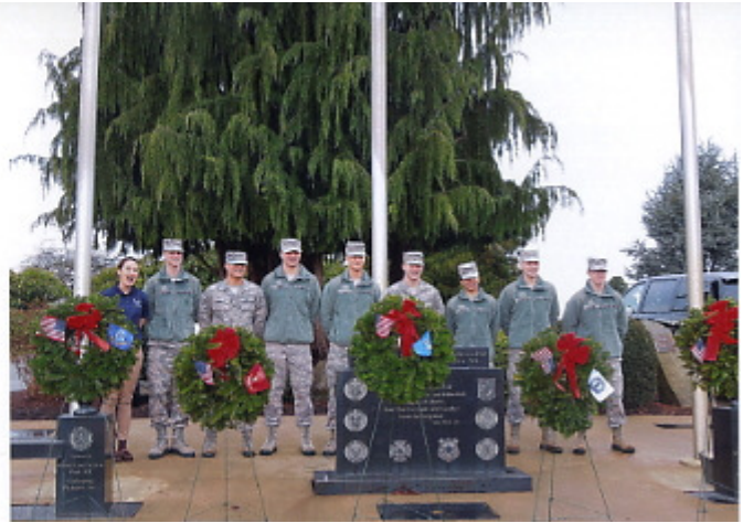
University of Washington Air Force ROTC Cadets