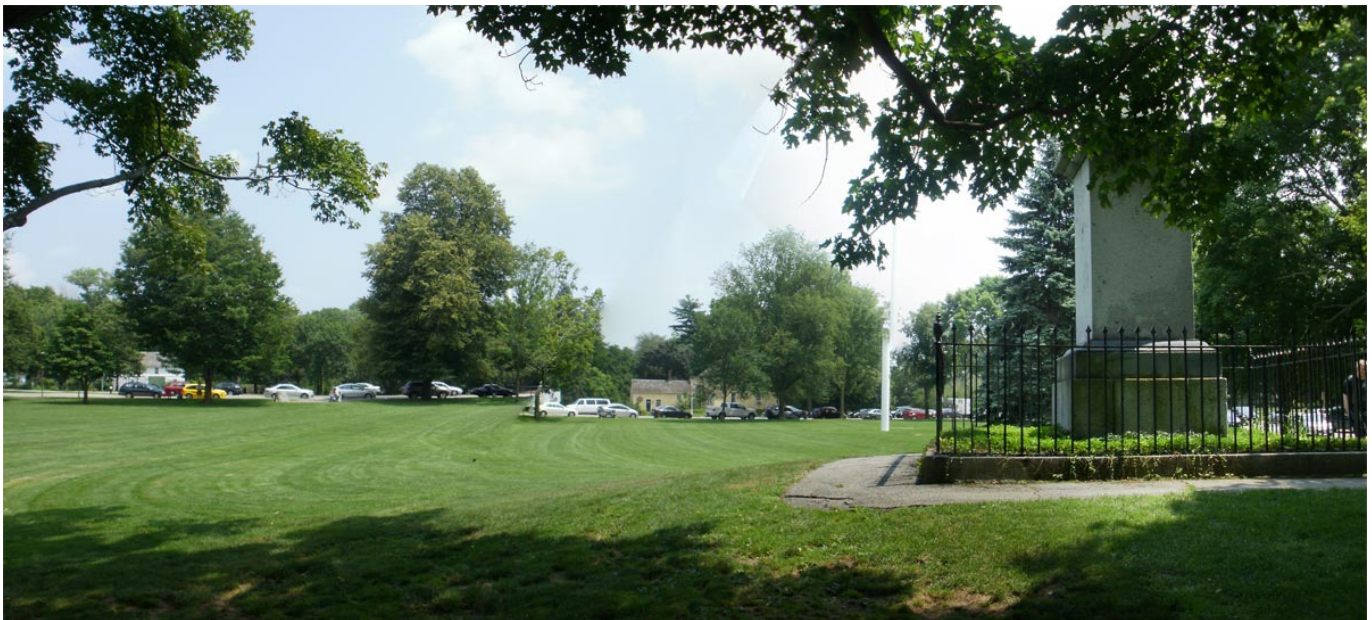
Lexington Green, on which field the Minutemen met the British Redcoats, spreads out from the monument. Original buildings from that day can be seen in the background.