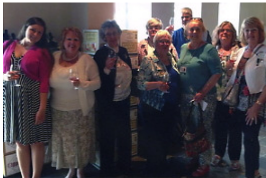
Ladies Auxiliary members at a Kennewick winery.

The National Ladies Auxiliary's last meeting took place in conjunction with SAR Congress held in Kansas City last July. I encourage all ladies who might attend a Congress with their spouses to plan on taking in the NLA business meeting even if you are not a member as it will give you the big picture of what this organization is doing and how successful they have been. In addition, there is always an interesting guest speaker included in the program. A second event to attend is the Ladies Luncheon hosted by the First Lady; this is always a fun event plus gives us the opportunity to meet others from across the country.