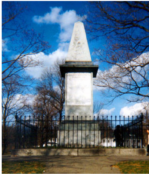
The monument with inscribed plaque.